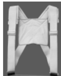
Heavy Duty Padded Comfort Harness Fits Bag or Bucket