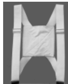
Heavy Duty Comfort Harness Fits Bag or Bucket